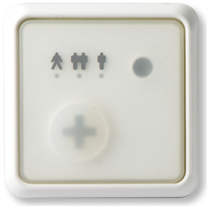
CLB C2100 Nurse Call Module 1

CLB's C2100 nurse call module is the standard nurse call unit with a contemporary and practical design. The materials that have been used are innovative and the soft touch buttons make the unit very user friendly.