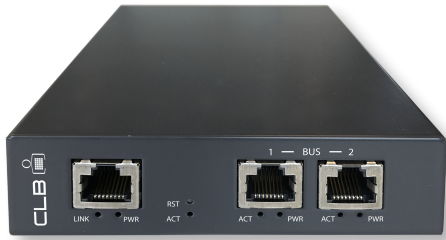
CLB C8101-h Local Controller